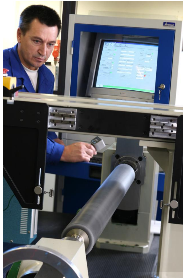
Contactless measuring by a laser