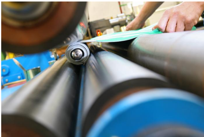
Calendered plates are wrapped around the core