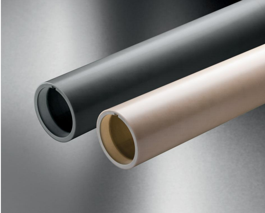
DuPont Packaging Graphics will market products such as these hard surface bridge adapters manufactured by Inometa, as part of the DuPont™ Cyrel® round flexographic printing workflow.