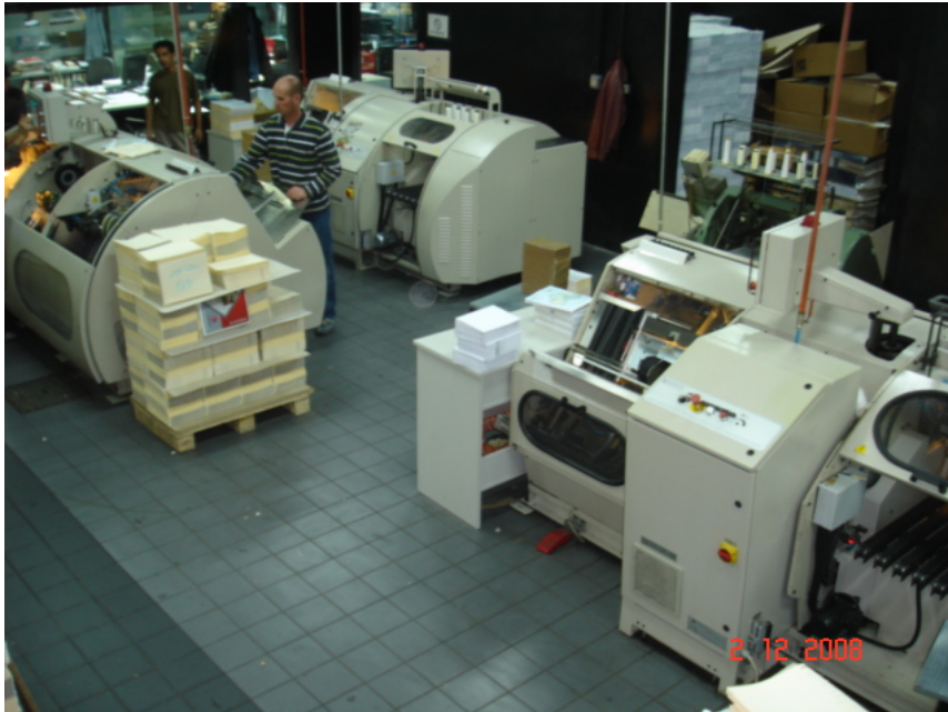
Overview of the Meccanotecnica machines at Express International

For more information on Meccanotecnica and its product range kindly contact your local Dynagraph partner.