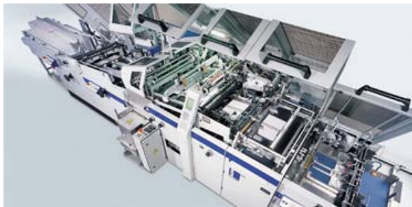
The KOLBUS Casemaker DA_270 - Material troughfeed

Also to be presented for the very first time, the brand new KOLBUS line production based on a DA 270 with an additional inline coupled system for inside lining with cold glue. This line shows the worldwide most effective production line for file manufacturing.